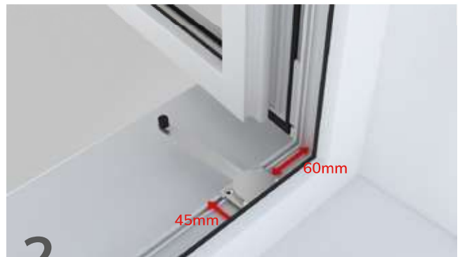
2 Insert the blockade base into the window frame about 60 mm from the inside edge of the window frame.