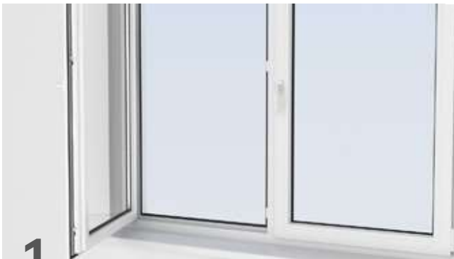
1 Open wide the window sash .