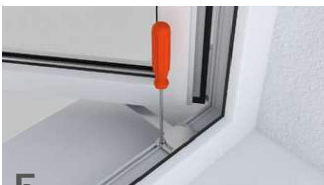
5 Tighten the screws