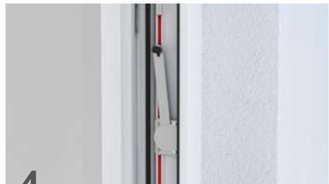
4 Set the blockade arm in the groove axis.