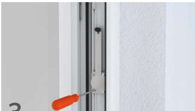
3 Tighten the screws.