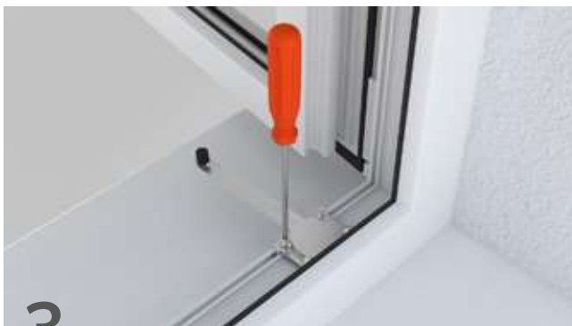
3 Tighten the screws partially.