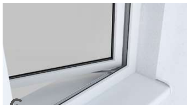
6 Blockade is ready to use