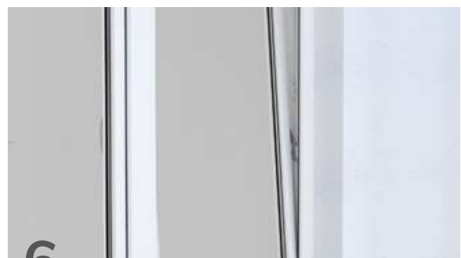
6 Blockade is ready to use