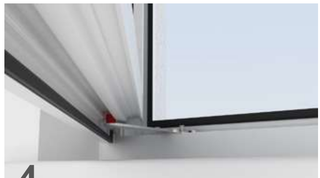
4 Insert the Blockade arm into the groove window sash or balcony door groove.